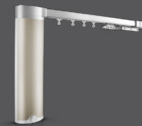
Glydea ULTRA 35e